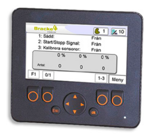
PLC based control system