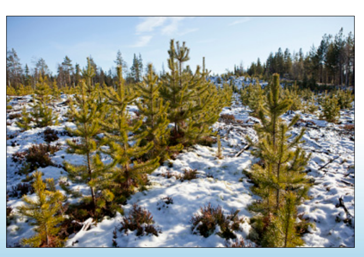
Very good production after scarification and sowing with the $35.a.