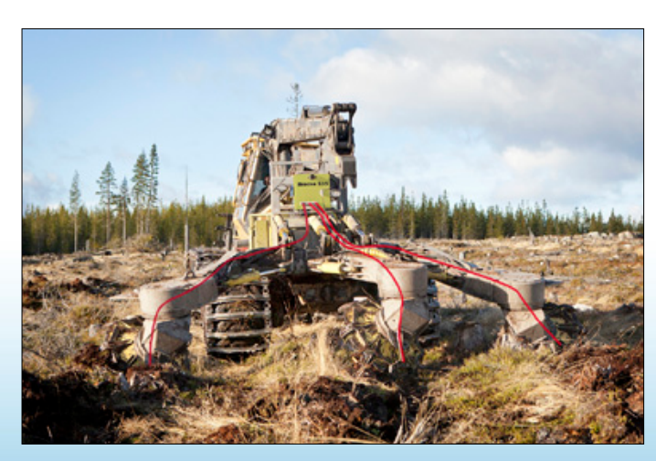
The Bracke $35.a can be attached to a one-, two-, or three-row scarifier.